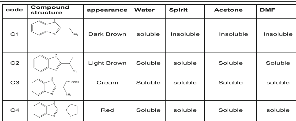
Table 4 Solubilities and appearance of synthesized compounds

In the present study, benzimidazole analogues were synthesized and investigated for their antibacterial action by